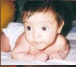
10 weeks after birth

21 week fetus in-utero grasps surgeon's finger after corrective surgery for spina bifida.