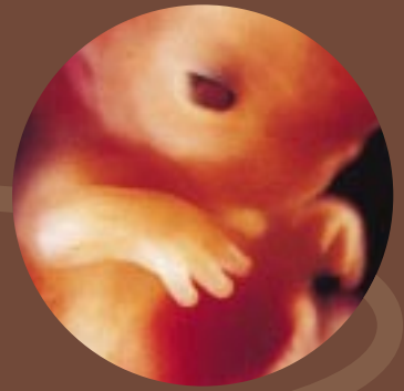
7 week embryo (brainwaves at 6 wks)