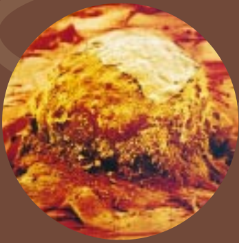
implantation (6 days)