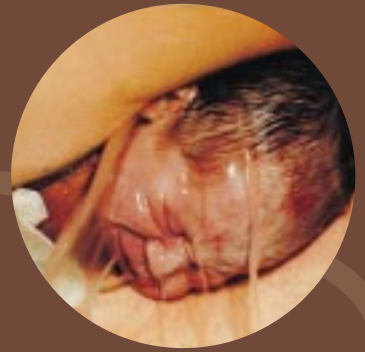
partially born fetus