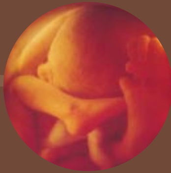
3rd trimester fetus (35 wks)