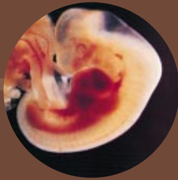
4 week embryo (heartbeat at 3 wks)