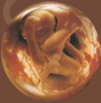
2nd trimester fetus (18 wks.)